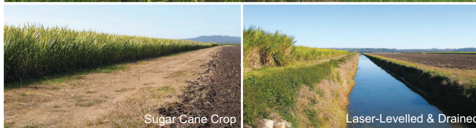
Sugar Cane Crop